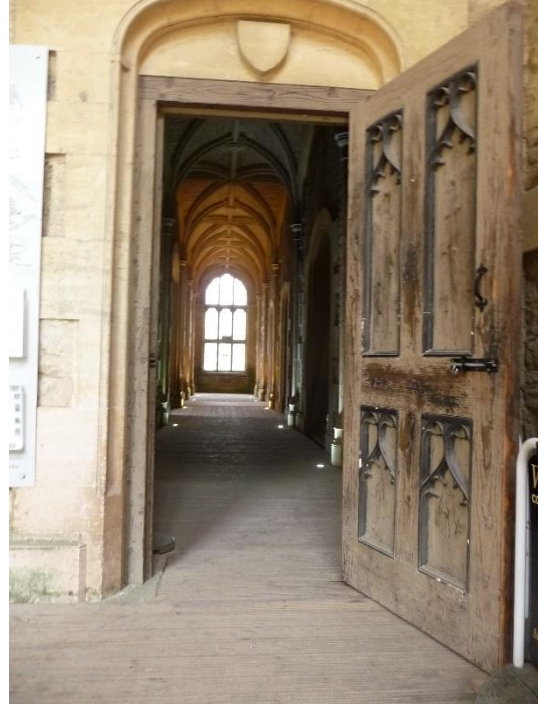
Entrance to Ticket Office and entrance to Main Corridor